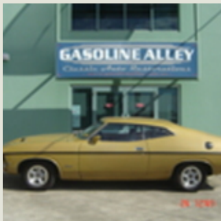
DSC3170.JPG 6 years ago

Sunday 2nd June 2013 OPEN DAY 9am 5 years ago