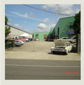
- 12 years ago