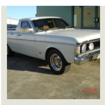
- 12 years ago