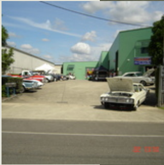
- 12 years ago