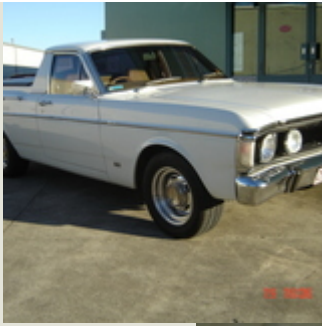
- 12 years ago