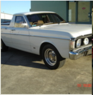
- 12 years ago