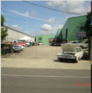
- 12 years ago