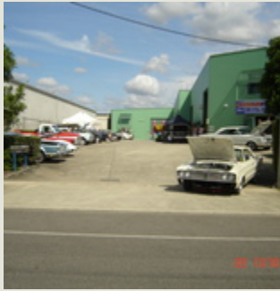
- 6 years ago