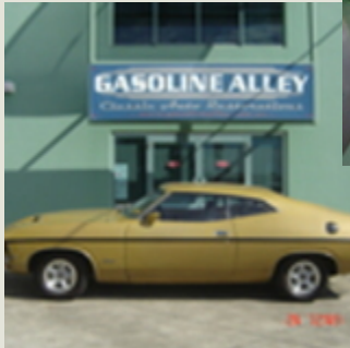
DSC3170.JPG 6 years ago