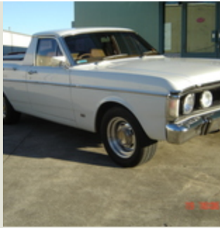
- 6 years ago